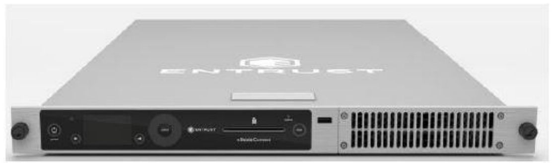
Figure 2: nShield Connect XC HSM