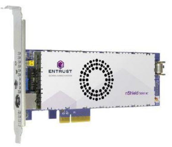
Figure 1: nShield Solo XC

The TOE is a general purpose Cryptographic Module, which comes in a PCI express board form factor which comes in a tamper resistant enclosure. The TOE performs encryption, digital signing, and key management on behalf of an extensive range of commercial and custom-built applications including public key infrastructure (PKIs), identity management systems, application-level encryption and tokenisation, SSL/TLS, and code signing.